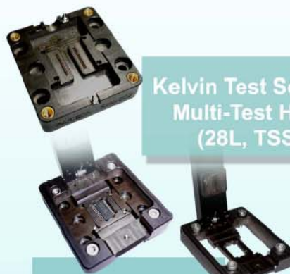
Kelvin Test Socket for Multi-Test Handler (28L, TSSOP)