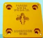
DFN Kelvin Socket 3x4mm, 12L