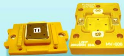
C-Pin Test Socket for QFP, 164L, 0.4mm Pitch