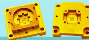
QFN C-Pin Socket 7x7mm, 48L