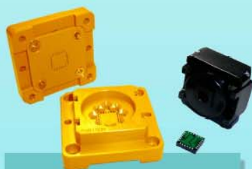
SIPLGA Socket 6.5x6.5mm, 24L