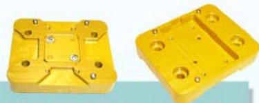
Kelvin Test Socket for Rasco Test Handler