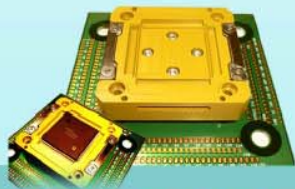
C-pin Test Socket for QFP, 208L, 0.5mm Pitch